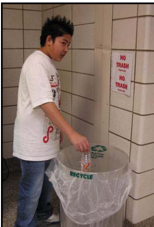
NW Classen student uses new recycling bin donated by DEQ

For this year's ULS week, DEQ Land Protection collaborated with The Oklahoman on a 16-page insert about the life cycles of everyday products, using less stuff, the ecological footprint,