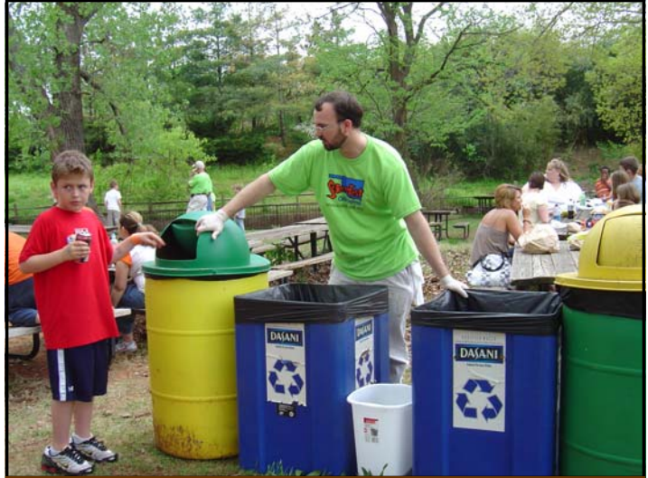
The Recycling Station at Sciencefest

climate change and energy efficiency, and various environmental projects being conducted at Oklahoma schools. The article achieved a readership of 20,000 students and their teachers in 800 schools statewide. DEQ assisted C.A.S.T. (Cultural Awareness for Students and Teachers) with a new Earth